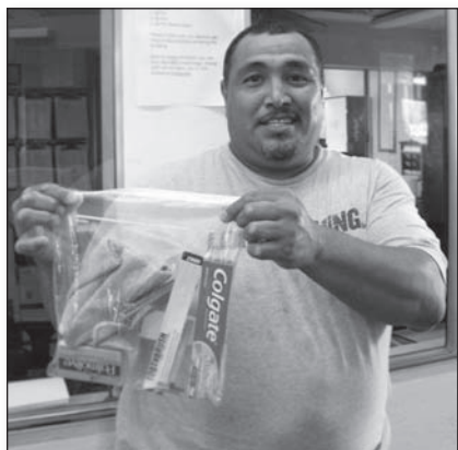
A Men's Shelter resident shows off the toiletries kit given to each man after the dinner.