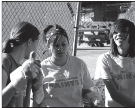
Over forty volunteers turned out to help install a laundry greywater system and wash and paint interior walls at Casa Paloma Women's Center.

The Primavera Foundation partnered with another local non-profit, Watershed Management Group and NeighborWorks® America for this year's NeighborWorks® Week event at our drop-in and housing program for homeless, unaccompanied women, Casa Paloma. The laundry facilities at Casa Paloma can wash as many as 200 loads of laundry per month. Using almost 40 gallons of water per load, this is an enormous use of a precious commodity in the desert: water. Using Watershed Management's expertise, 44 volunteers came together to learn about and construct a greywater system off Casa Paloma's washing machines that will utilize the laundry water a second time by watering plants. Volunteers dug basins and reinforced their walls with large rocks, installed pipes and French drains to distribute the greywater to the basins, planted fruit trees and native plants and also spread mulch throughout the basins and around the new plants. Volunteers accomplished these activities all while learning how they might install a similar system at their own home and why water conservation is