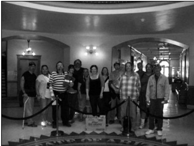
Primavera staff and participants gather around the rotunda of the Arizona Capitol Museum before joining the homeless advocacy demonstration on the Arizona Capitol House Lawn.