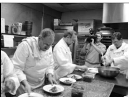
2009 Title Sponsor Cox Communications shooting the Apprentice Chefs at work.