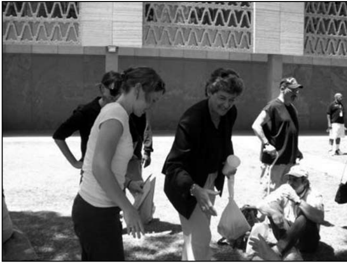
Senator Paula About (LD 28) greets Primavera staff and participants before joining the group for lunch.