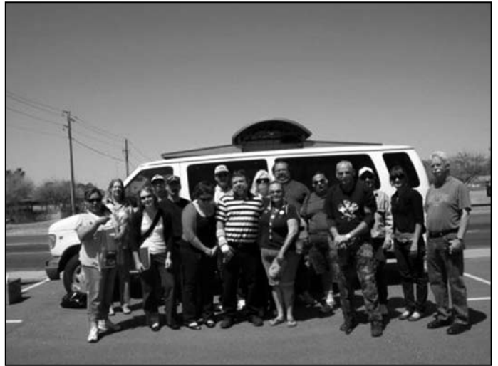
Primavera staff and participants arrive safely at the Arizona State Capitol building in Phoenix.